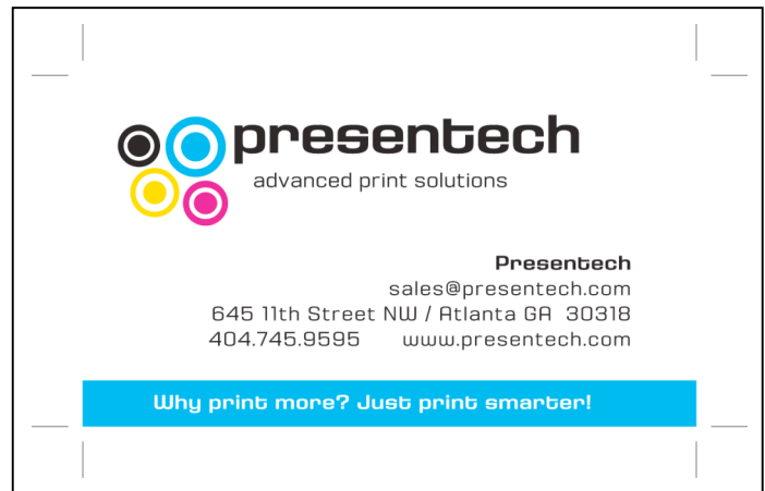
INCORRECT: Missing bleed

Bleed refers to the amount of area that a color or image extends past the edge of the page. Bleed is needed to properly trim your cards so that a thin white edge does not show after the cards are trimmed from a larger sheet.