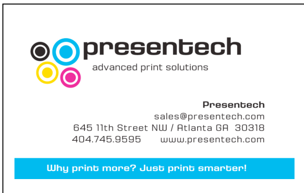
INCORRECT: Missing crop marks

If your card includes a background or graphic, you must include 1/8" bleed in your design.