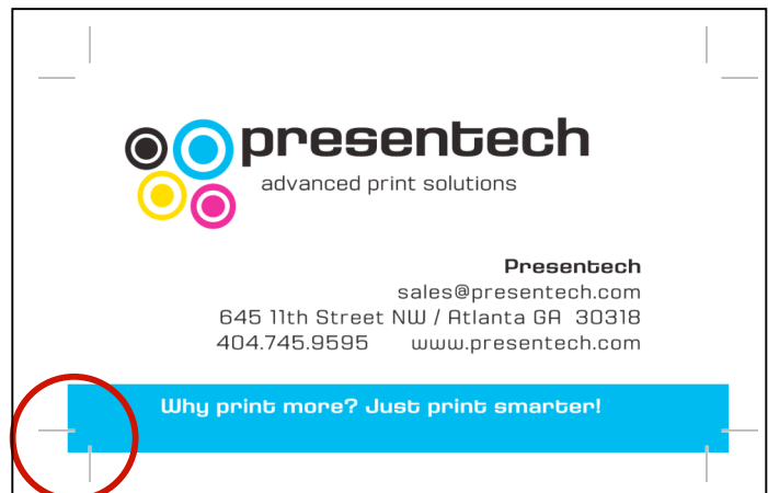
CORRECT: Includes crop marks and bleed

Bleed refers to the amount of area that a color or image extends past the edge of the page. Bleed is needed to properly trim your cards so that a thin white edge does not show after the cards are trimmed from a larger sheet.